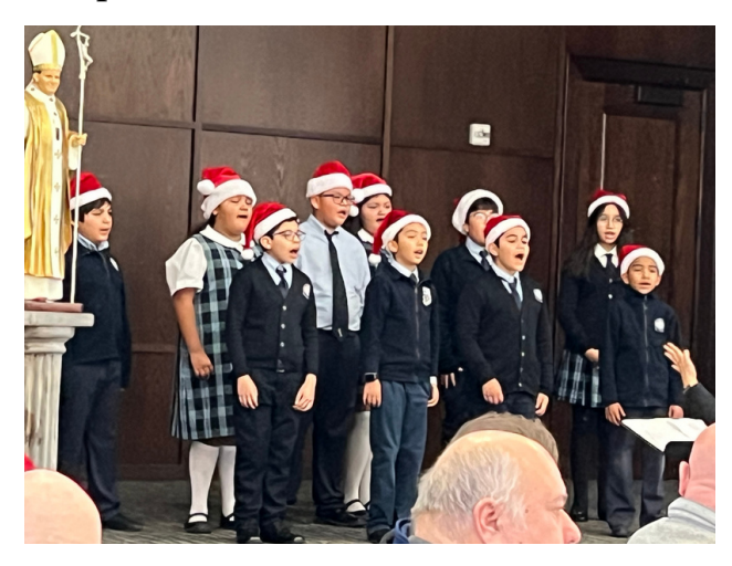
The brunch was opened with bilingual Christmas Carols from All Saints School students.