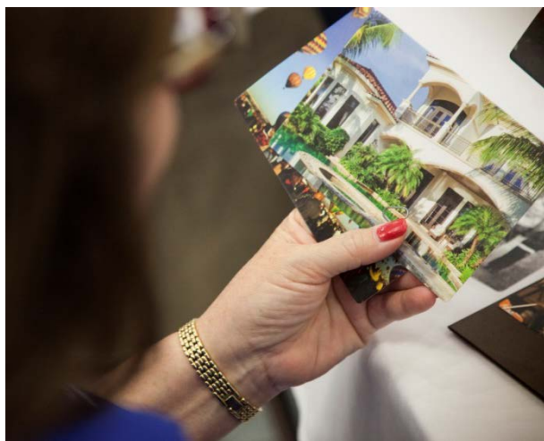
A Building Your Legacy guest participates in the Picture Your Legacy activity at a recent event.

Building Your Legacy presentations offer an opportunity to participate in an exercise that can guide your discernment about your passions and provide you with the tools to consider how you can honor them when you are no longer here. Please join us for this free, informational event to begin Building Your Legacy . RSVPs are requested in order to ensure there is enough food and materials for everyone.