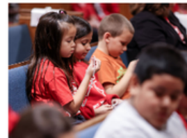
The children learn about the rosary at St. Maria Goretti Catholic School in Arlington.

A Catholic school like St. Maria Goretti is on a mission. It is not just about today's mission—though that is where most of us do our giving. It is not even about a building that needs ongoing repair. It is about creating a durable foundation that lasts for generations to come. Thanks to forward thinking supporters, St. Maria Goretti Catholic School holds more than $1.5 million in endowment funds that continue to grow while also providing a perpetual stream of revenue to the school each year.